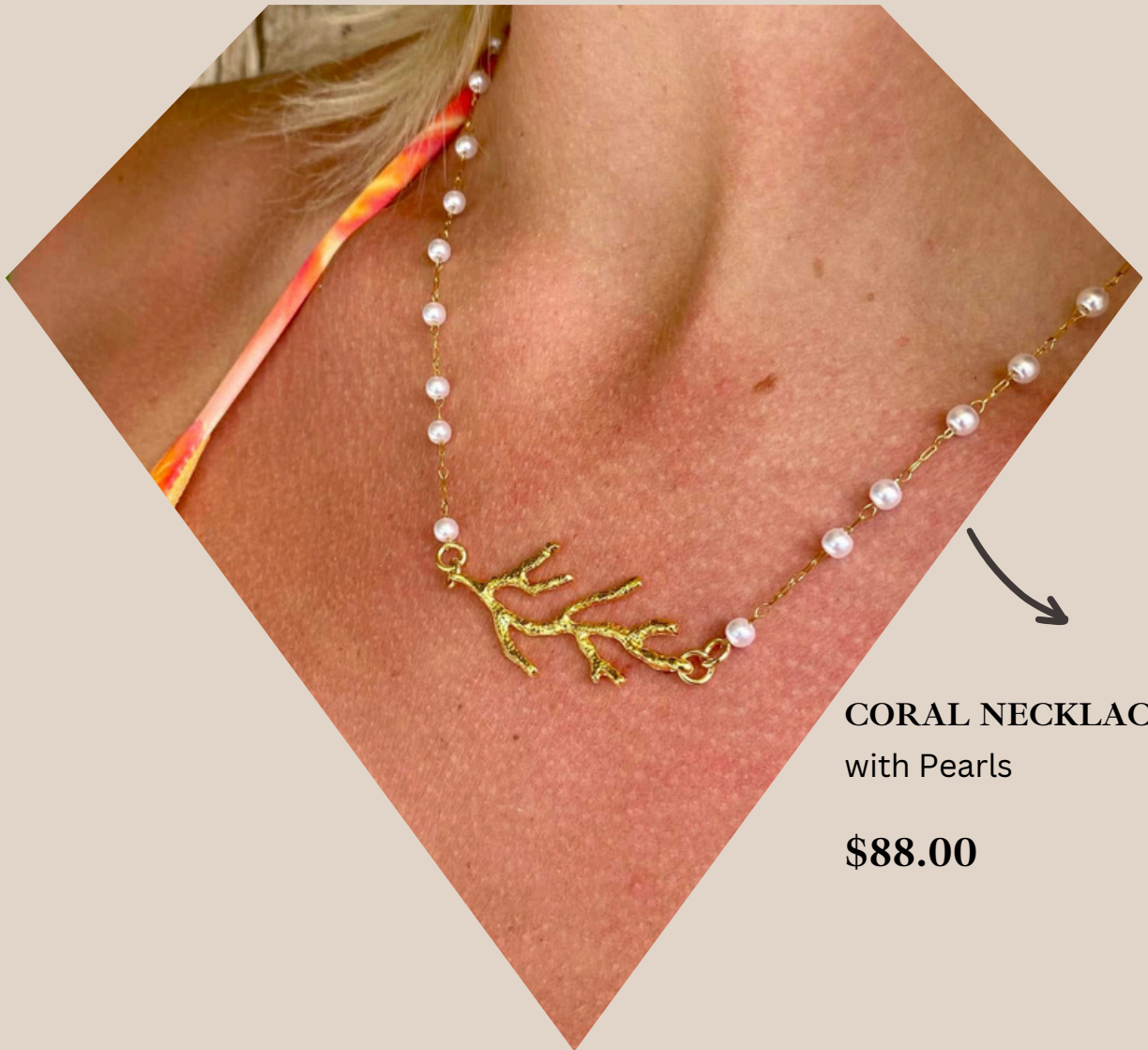
CORAL NECKLACE with Pearls