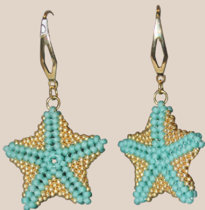
JADE AND GOLD STARFISH EARRINGS